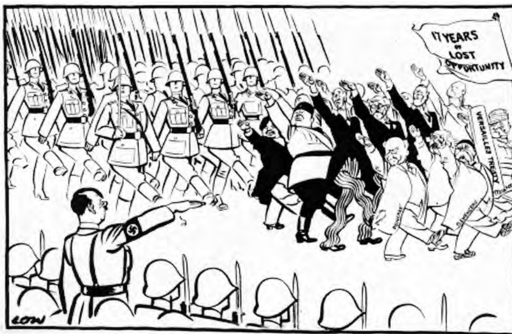
A cartoon, entitled 'Cause Precedes Effect', published in a British newspaper, 1935. It shows a parade of world statesmen led by the Versailles peacemakers.