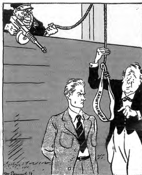
A cartoon published in the Soviet Union, 1938. The Englishman is telling the Czech to put his head into the noose rather than being shot by the German. The words on the noose mean 'Accept defeat'.