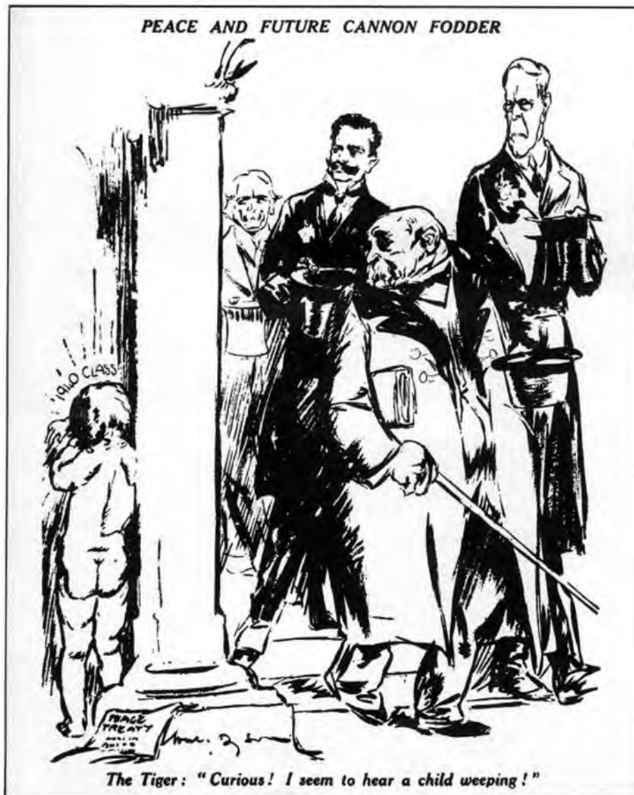
A cartoon published in a British newspaper, May 1919. 'The Tiger' refers to Clemenceau.