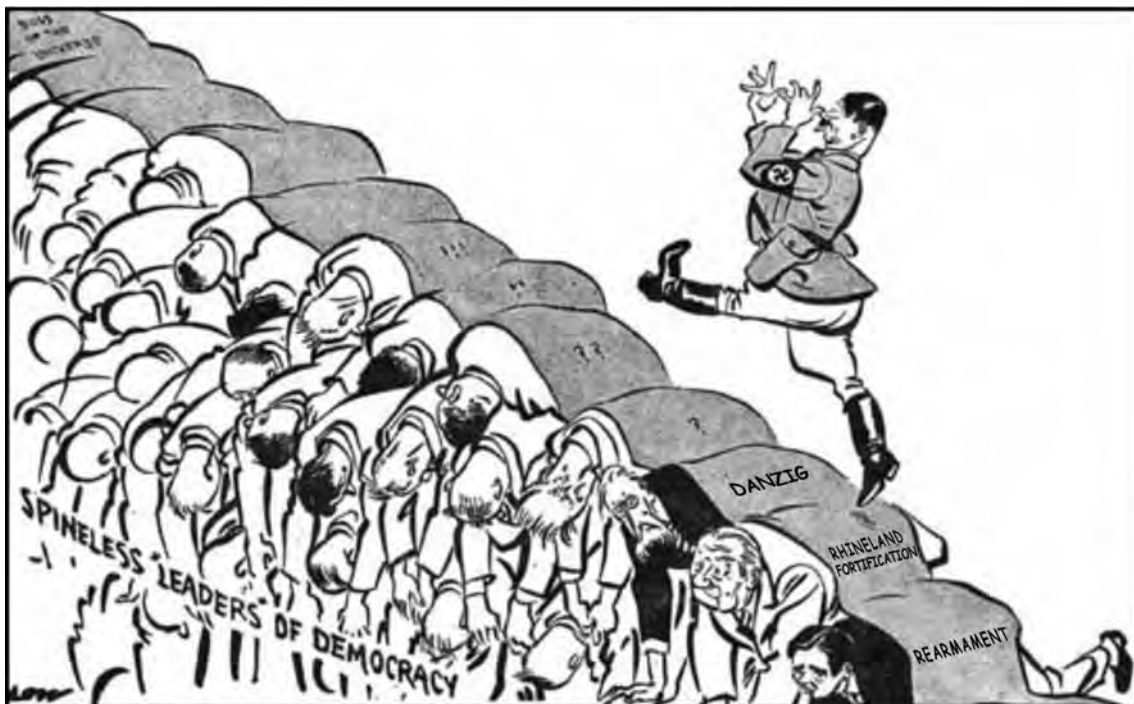
A cartoon, entitled 'Stepping Stones to Glory', published in a British newspaper, July 1936.

Written by Lloyd George at the time of the peace talks in 1919.