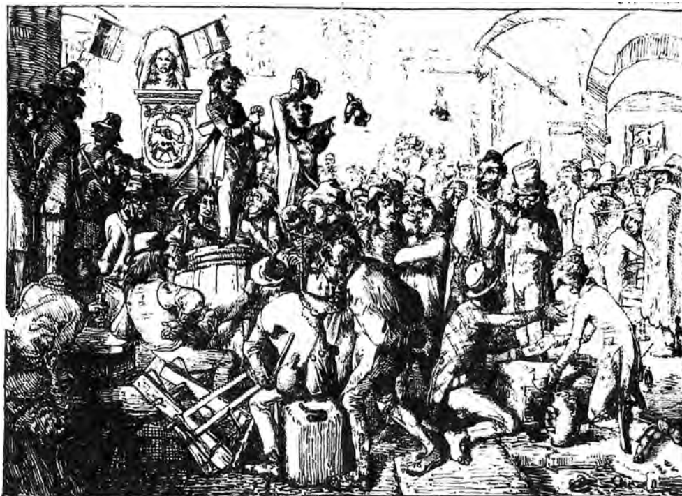
A cartoon published in Germany in 1848 entitled 'Parliament of the future'.